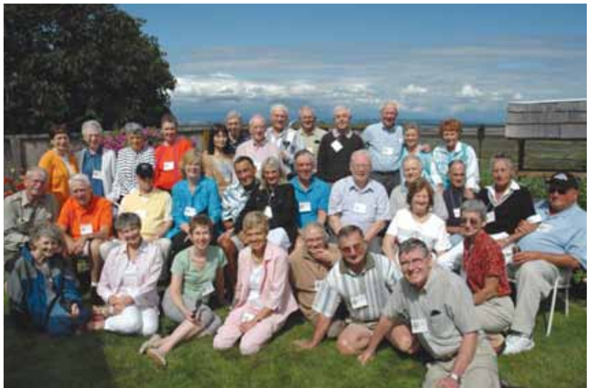
Names of attendees at VC class of '51 re-union, June 15th, 2006. (Left to right)